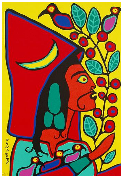
Self Portrait ~ By Norval Morriseau